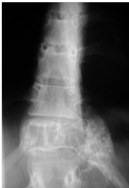
Figure 1. AP X-ray of thoracic spine demonstrated an ill-defined osteolytic lesion on the left in the twelfth thoracic vertebra with erosion of the pedicle and transverse process and involvement of the left costovertebral joint with soft tissue shadow and calcification