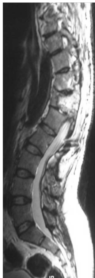
Figure 4. MRI of the thoracic spine: sagittal view (T2-weighted image) illustrating local relapse of the tumor

Follow-up MRI examination in December 2012 revealed that the tumor had locally relapsed without involvement of the spinal canal with high signal areas of the left half of T12 and enhancement after gadolinium injection (Figure 4). The patient was last examined in March 2011. He was clinically well.