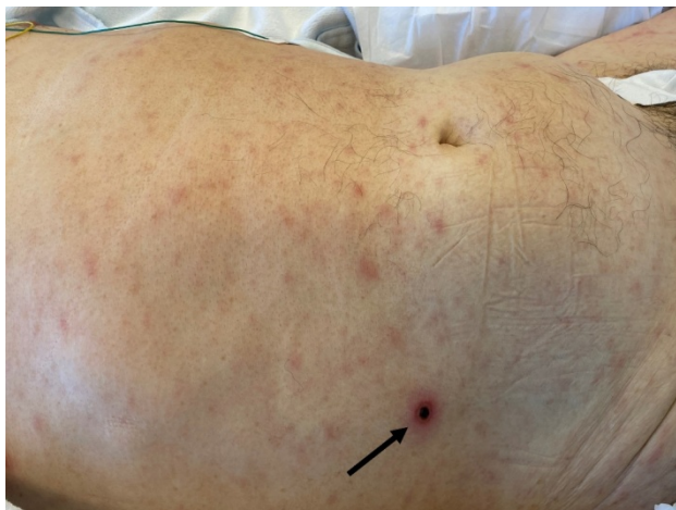
Figure 1. A full body skin examination performed on arrival (After exposing the patient, he was found to have multiple macular skin rashes with an eschar with a red halo in his lower right abdomen (arrow))

During the 60 minutes of transportation, he showed generalized convulsion, and on arrival, he continued to show convulsion. After exposing him, he was found to have multiple macular skin rashes with eschar with a red halo on his lower right abdomen (Figure 1). His blood pressure and percutaneous saturated oxygen were unmeasurable, and his heart rate was 140 beats per minute. He was treated with anticonvulsant and massive infusion after securing a venous route.