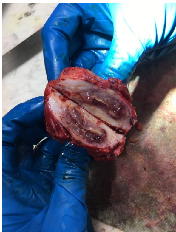
Figure 3. Macroscopic sample of colo-cutaneous fistulectomy

The patient eventually required colo-cutaneous fistulectomy (Figure 3) and creation of a colostomy to restore oral feeding and improve nutritional status. Biopsy of the sigmoid colon showed mixed inflammation, presence of Paneth cell metaplasia, crypt distortion, and cryptitis extending through the fistulous tract. These results were interpreted by two pathologists as most consistent with ulcerative colitis. Eight weeks after surgery, follow-up flexible sigmoidoscopy and endoscopy through the