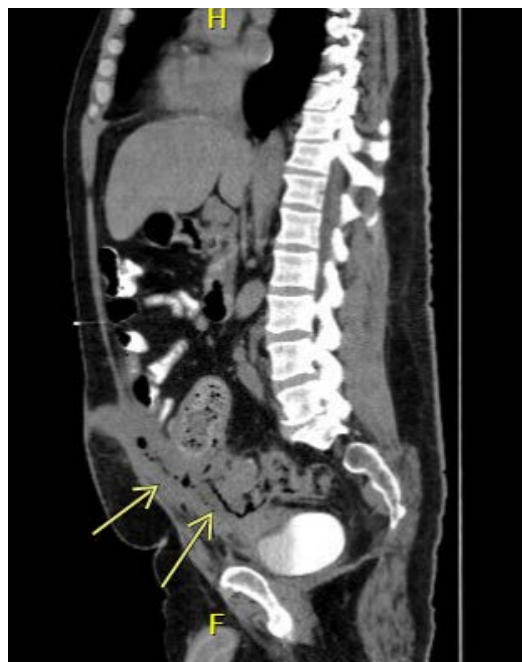
Figure 1. CT abdomen and pelvis with oral and IV contrast. Sinus tract from the sigmoid to the umbilicus

A 49-year-old African American male with history of diverticulosis and recurrent episodes of diverticulitis presented to the ED with two days of abdominal pain and feculent discharge from the umbilicus. Past medical history included uncontrolled Type 2 diabetes mellitus, uncontrolled hypertension, bipolar disorder, and chronic opiate use for back pain. CT scan of the abdomen and pelvis with IV and oral contrast showed a soft tissue density tract containing air and feculent material extending from the sigmoid colon to the umbilicus (Figure 1).