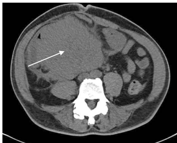
Figure 1. Large mass extending throughout the lower abdomen and pelvis measuring 19cmx17cm. Engulfing the right colon and cecum without evidence of small bowel obstruction

A 57-year-old African American male with a past medical history of Hodgkin lymphoma (HL) and diabetes mellitus presented to the general surgeon with complaints of a growing abdominal mass. The abdominal mass was incidentally found by his primary physician on a routine chest computed tomography (CT), which revealed a partially visible large mass within the right middle to lower abdomen, possibly originating in the cecum. Repeat CT scan of the abdomen and pelvis demonstrated an expansive tumor encompassing the right colon and cecum without obstruction of the small bowel, as well as right sided hydronephrosis from compression on the ureter (e.g. Figure 1).